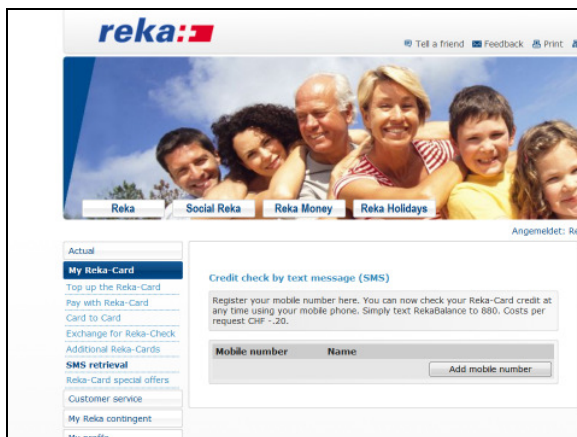
Registration on RekaNet

You register your mobile number with Reka on the RekaNet under “SMS-balance queries” and for the PostFinance account register either at the Post Office or via E-Finance under “Service” / “PostFinance Mobile”.